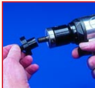
AN ADAPTER IS INCLUDED WITH THE 7/16-20 BACK-UP PAD TO ALLOW EZ-VIEW DISCS TO BE USED ON 5" PISTOL GRIP GRINDERS RATED AT 20,000 RPM.

The EZ-View back-up pad must be used with all E-ZView discs. The 7/16-20 high RPM back-up pad includes an adapter which allows the E-ZView Flex-Loc system to be used on pistol grip grinders rated for 20,000 RPM or less.