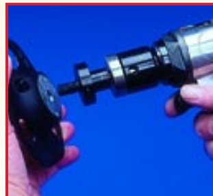
AN EZ-VIEW BACK-UP PAD MUST BE USED WITH ALL EZ-VIEW DISCS.