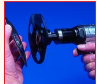
THE FAST CHANGE FLEX-LOC DISC GOES ON WITH A TWIST.