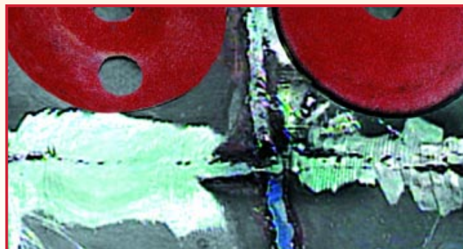
E-ZView Disc GRINDING AT A FLATTER 5 TO 15 DEGREES HELPS TO ELIMINATE GOUGING AND REDUCES DISC WEAR.

THE HOLES IN THE E-ZVIEW SYSTEM FEATURE SCOOPS THAT CREATE AN AIR FLOW, PULLING ABRASIVE GRIT AND METAL SWARF AWAY FROM THE GRINDING AREA. THIS REDUCES LOADING, LOWERING GRINDING TEMPERATURE BY 20%, WHICH RESULTS IN SIGNIFICANTLY LONGER DISC LIFE.